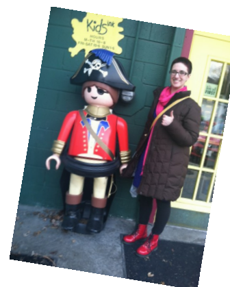
Waiting for David Levithan & Rainbow Rowell at Kids Ink in Indy

One of the things I loved was that the presenters started off by talking about how discouraging it can be to attend conference presentations and hear nothing but success stories that seem impossible to replicate. They all talked about programs that completely BOMBED at their libraries...even though that same event had been successful for someone else.